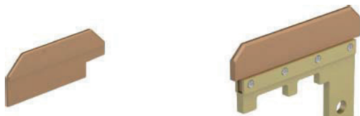
CCB24-130(CMB200,CMBL200 için) CCB32-147(CMB400,CMBL400 için) CCB32-180(CMBT500 için)