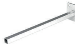
MBTA133 (CMBL200 için) MBTA134 (CMB200,CMD400,CMBL400,CMBT500 için)