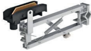
CMBL-200 (H24) CMBL-400 (H32)