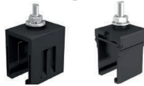
CHC24-1 CHC32-1 CHC24-2 CHC32-2