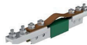
CEJH24-Al(Al:250A~300A) CEJH32-Al(Al:320A~1250A) CEJH24-Cu(Cu:500A~800A) CEJG32-Cu(Cu:800A~1600A)